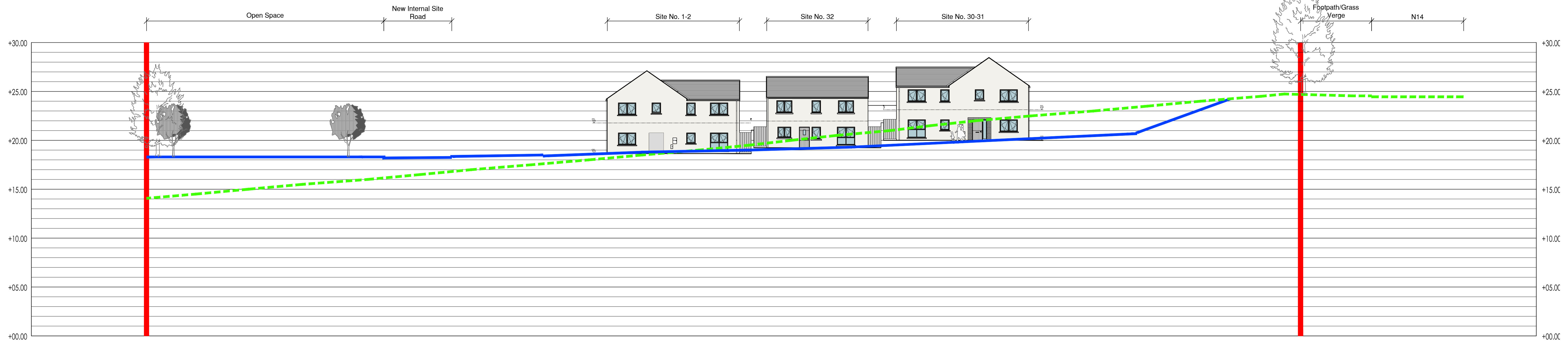
Site Section C-C Existing Ground Levels --- Proposed Ground Levels — Application Boundary —